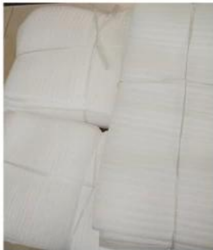
PE Foam Bag