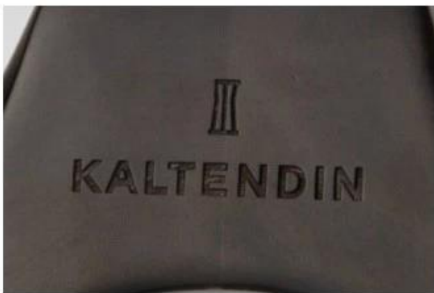
Laser logo before paint