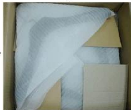
Place Layer by Layer

We pack plastic hangers with good quality transparent plastic bag, place into suitable custom K=K carton box, with suitable qty each carton, the box weight do not more than 15kgs. Print shipping mark outside each carton, it is very useful to distinguish goods in transit.