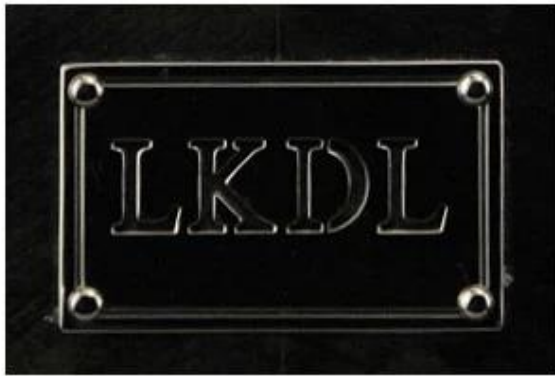
Metal plate logo