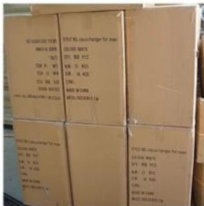
K=K Carton with Shipping Mark