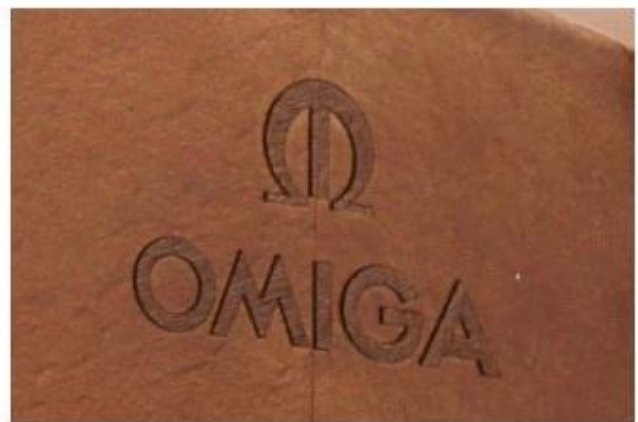
Laser logo before paint