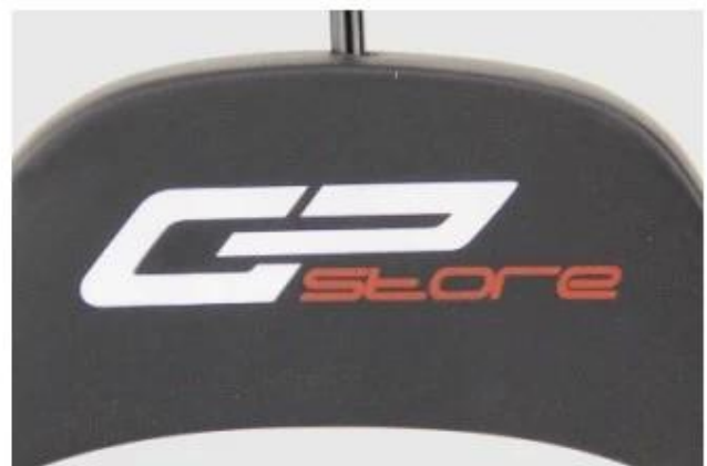
Silk-screen print logo