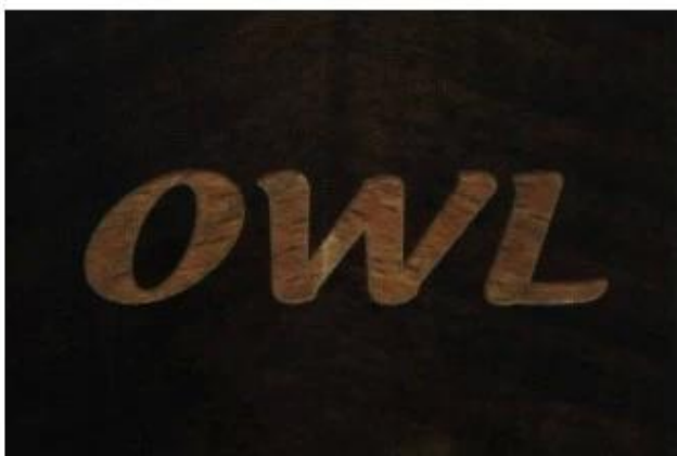
Laser logo after paint