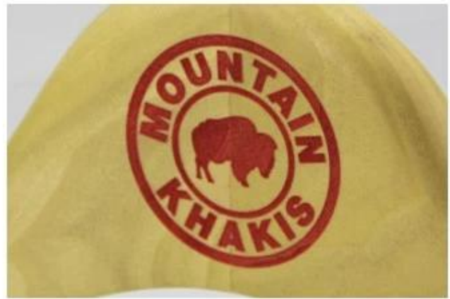
Laser logo in other color