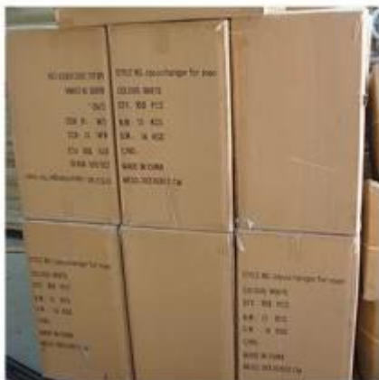
K=K Carton with Shipping Mark