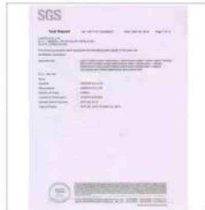
Product Test Report