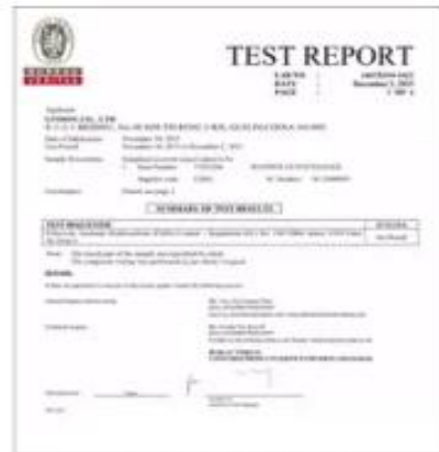
Product Test Report