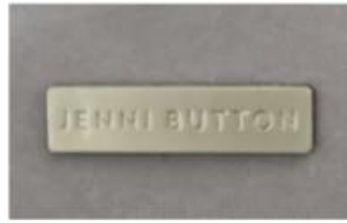
metal plate logo