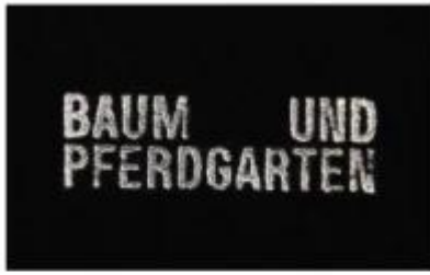
silver hot stamping logo