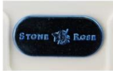
plastic plate logo