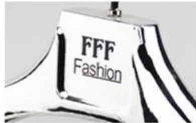
silk-screen print logo